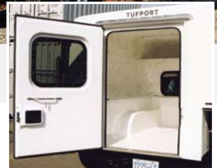
▲ Shown with single rear door

Ideal for: Camping / Fishing / Hunting / Climbing / Kayaking / Mountain Biking / ATVing / Snowmobiling