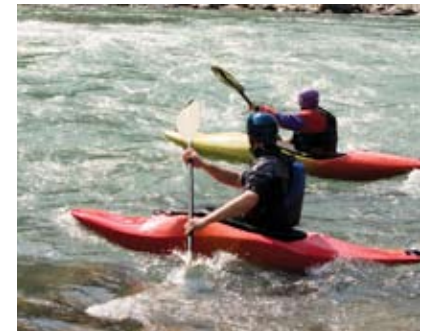
◆ T59 is great for rugged outdoor adventures

We're confident the Tufport™ T59 slide-in unit is rugged enough to tackle any backcountry adventure you take it on, and will outlast any truck on the market.